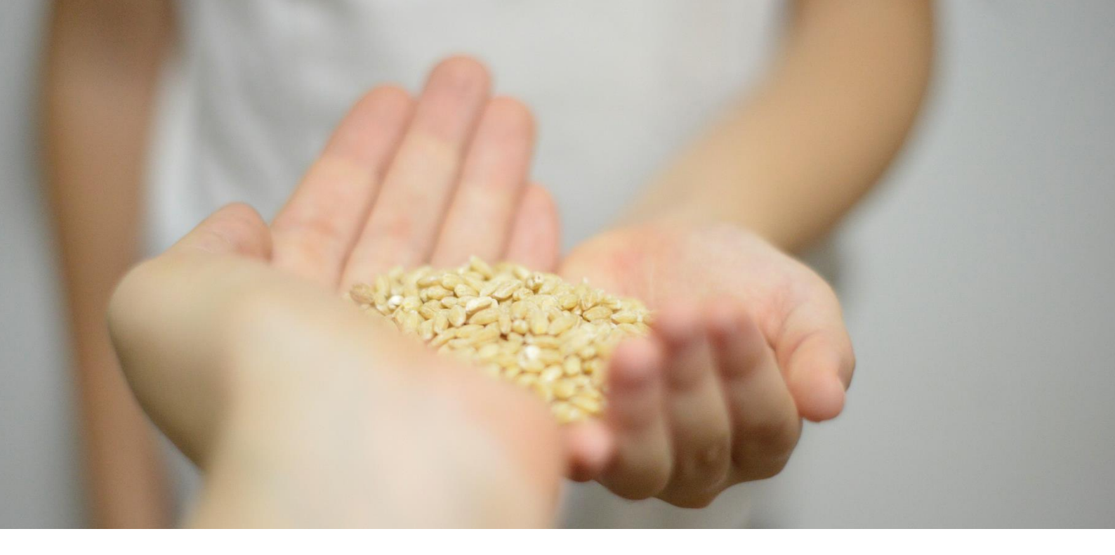
Exhibit at ICBC24

Exhibition will be open 22 - 25 April 2024. Exhibition will be arranged in the coffee break area to maximize interaction and networking opportunities between participants, exhibitors, and sponsors during all coffee and lunch breaks. Additionally, several attractive sponsorship options are offered, some of which have the table top exhibition included in the fee.